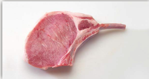
Durham Ranch Berkshire Pork 8 Bone Rack and Chop