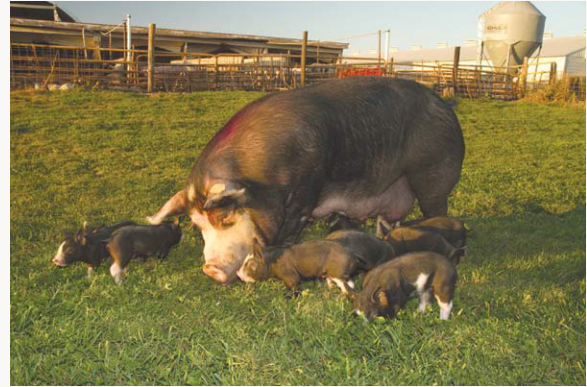
Kern's Family Berkshire Farm

100% Certified Berkshire pork, the "black pig", is prized around the world for its superior tenderness and flavor. Direct from family farms throughout the Midwest, Durham Ranch Certified Berkshire Pork is raised humanely. All natural, meaning they are grown without the use of hormones, antibiotic growth promotants or artificial ingredients. Durham Ranch Certified Berkshire are minimally processed.