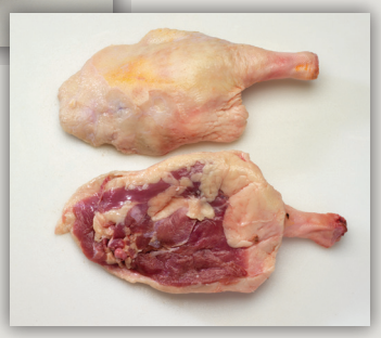
Durham Ranch Duck Leg