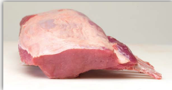
Durham Ranch Wild Boar French Rack

For centuries Europeans have known the benefits of this wild delicacy; not only for conservation and preservation efforts but for the value wild boar provides foodservice and retail customers. Throughout Central Europe, Wild Boar is considered one of the most premium meats available.