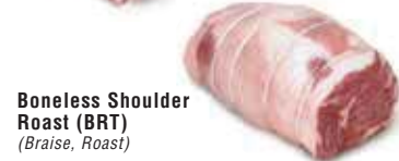
Boneless Shoulder Roast (BRT) (Braise, Roast)