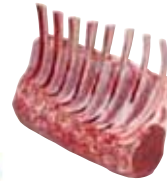
Frenched Rib Roast (Broil, Grill, Roast)