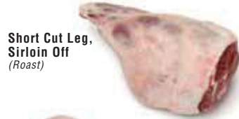
Short Cut Leg, Sirloin Off (Roast)