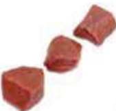
Cubes for Kabobs (Braise, Broil, Grill)