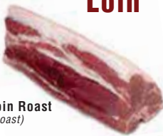
Loin Roast (Roast)