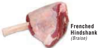
Frenched Hindshank (Braise)