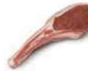
Rib Chop (Broil, Grill, Panbroil, Panfry, Roast)