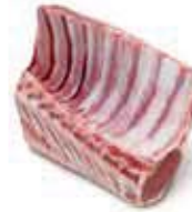
Rib Roast (Broil, Grill, Roast)