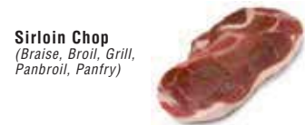
Sirloin Chop (Braise, Broil, Grill, Panbroil, Panfry)