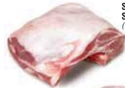
Square Cut Shoulder Whole (Braise, Roast)