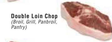
Double Loin Chop (Broil, Grill, Panbroil, Panfry)