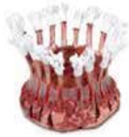
Crown Roast (Roast)