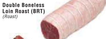
Double Boneless Loin Roast (BRT) (Roast)