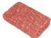
Ground Lamb (Broil, Grill, Panbroil)