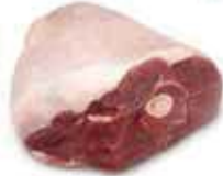
Center Leg Roast (Roast)