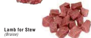
Lamb for Stew (Braise)