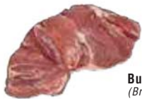
Butterflied Leg (Broil, Grill, Roast)