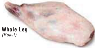
Whole Leg (Roast)