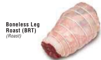
Boneless Leg Roast (BRT) (Roast)